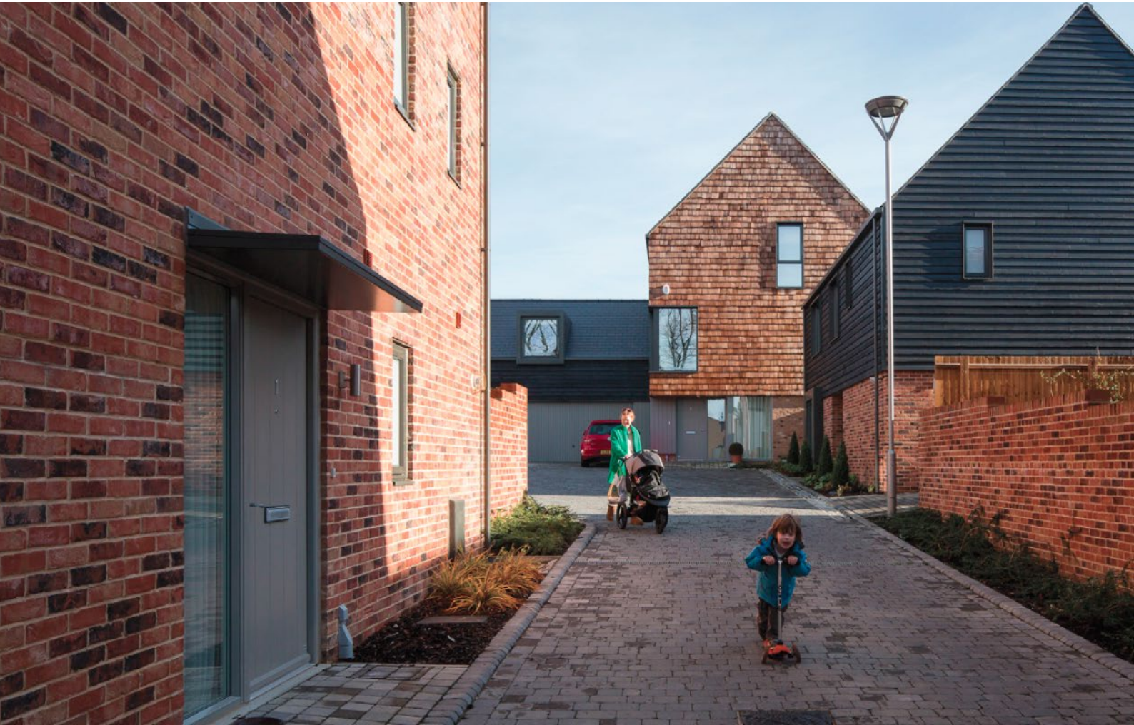
High quality hard landscaping, The Avenue, Saffron Walden, Hill

Creating streets for people where vehicle speeds are designed not to exceed 20 mph 18 . Work with the Highways Authority to create developments where buildings and detailed street design is used to tame vehicle speeds. Sharp or blind corners force drivers to slow when driving around them while buildings that are closer together also make drivers proceed more cautiously 19 . 20mph zones are becoming increasingly popular with local communities and are a cost effective way of changing driver behaviour in residential areas.