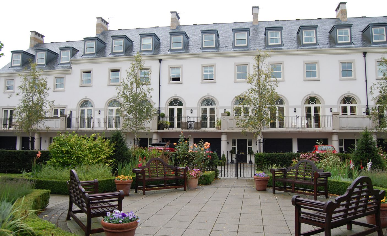
Shared garden, The Square, York, Nixon Homes

Clearly defining private and public spaces with clear vertical markers, such as railings, walling or robust planting. Where there is a modest building set back (less than 1m), a simple change in surface materials may suffice. Select species that will form a strong and effective boundary, such as hedge forming shrubs rather than low growing specimens or exotic or ornamental plants. Ensure sufficient budget provision is allocated to ensure a high quality boundary scheme is delivered.