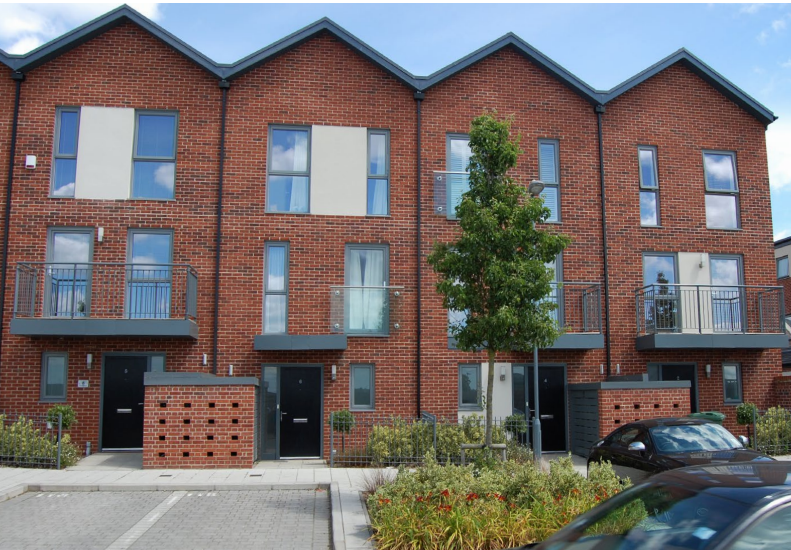
Robust brick bin stores, Centenary Quay, Southampton, Crest Nicholson

12b Is access to cycle and other vehicle storage convenient and secure?