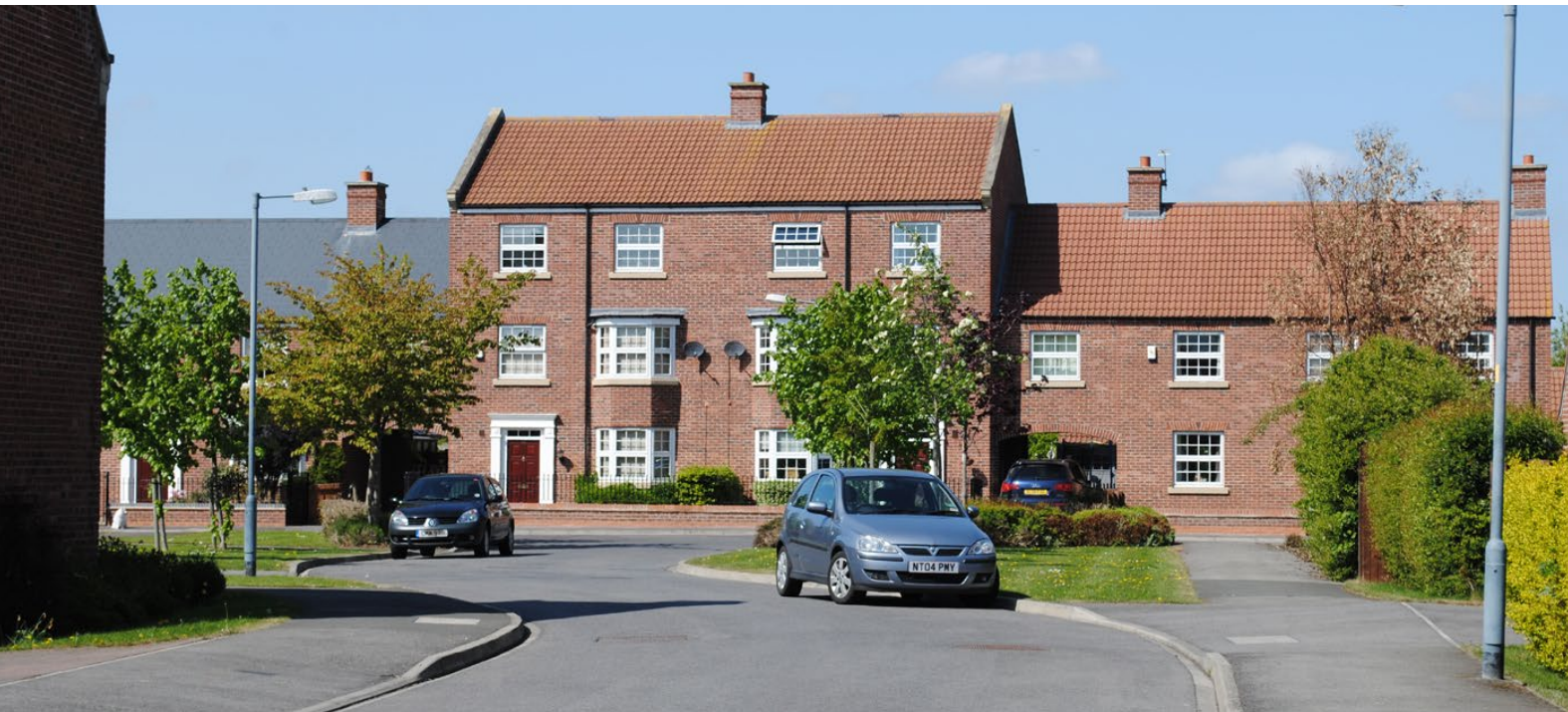
The Strike, Helmsley, Taylor Wimpey

BfL12 is a way of working that helps guide development proposals towards better design. Developments that are based on these principles will help developers demonstrate to local planning authorities that their proposals are well considered and responsive to considerations such as local characteristics specific to a given site.