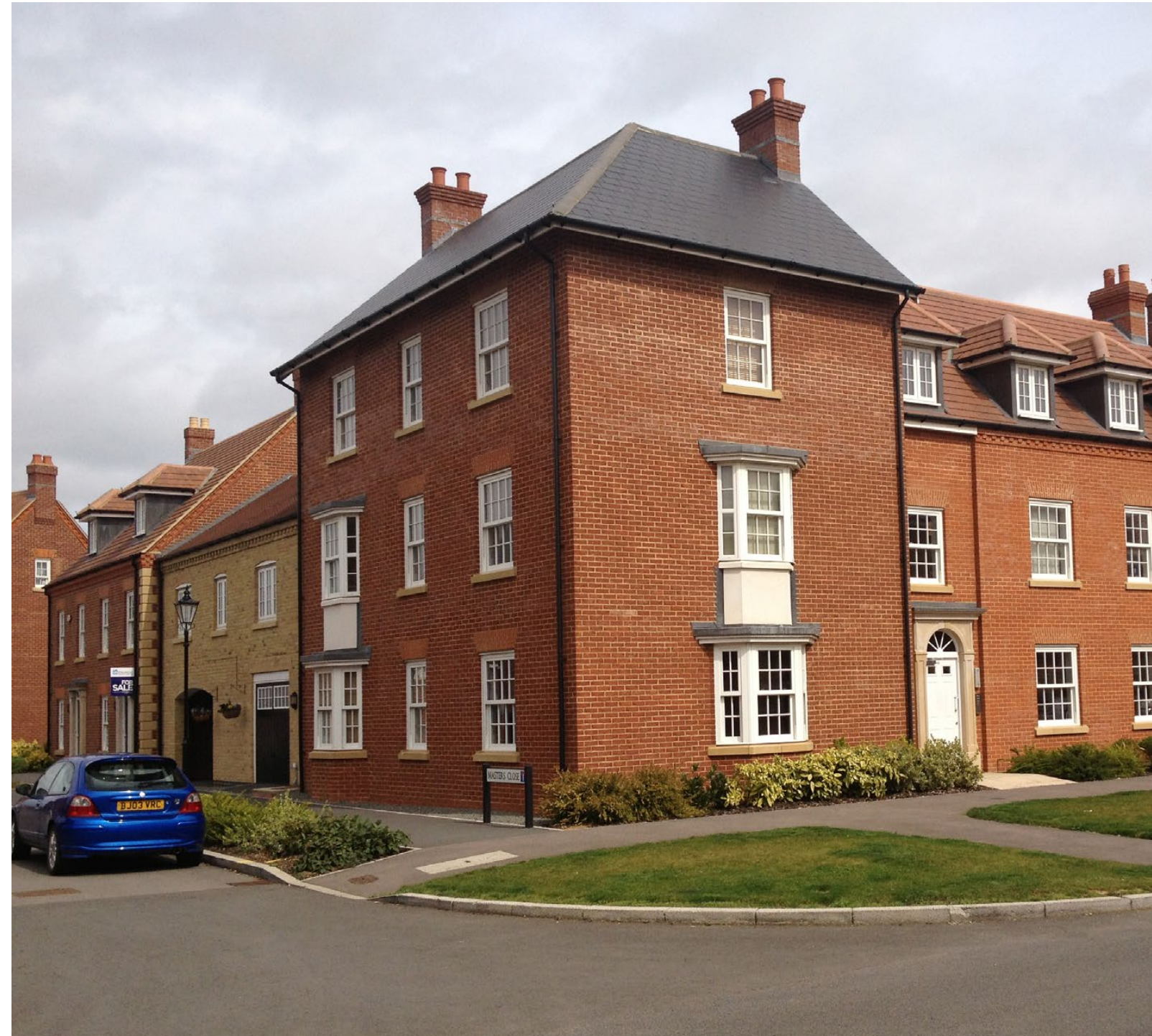
Apartment blocks at corner give streets definition and helps way finding, Bedford Park, Bedford, Barratt Homes

Layouts that separate homes and facilities from the car , unless the scheme incorporates secure underground car parking.