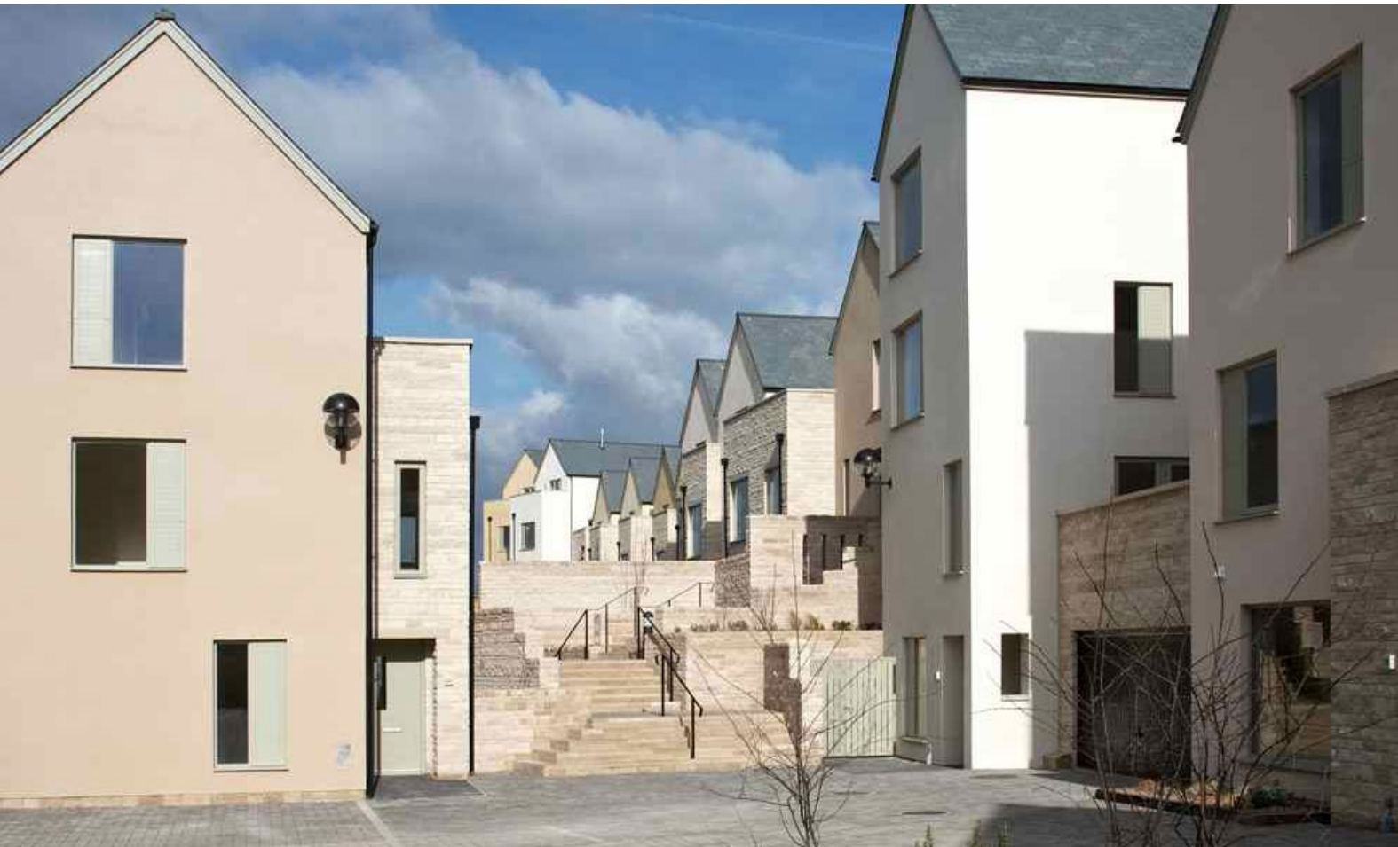
Hard landscaping is responsive to the different levels on site, Osprey Quay, Weymouth, Zero C Developments

6c Should the development keep any existing building(s) on the site? If so, how could they be used?