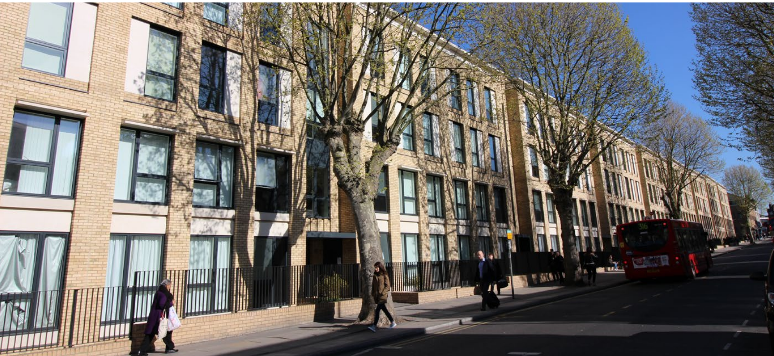
Kilburn Park, South Kilburn, Catalyst and London Borough of Brent

BfL12 is effective where local authorities use it as a way of working, framing pre-application discussions relating to design and support decision-making against the twelve questions. Yet, BfL12 is at its most effective where it is used as a 'golden strand'. The 'golden strand' comprises of a series of elements. Local authorities are encouraged to work towards putting each of these elements in place. In some situations, we recognise it might be difficult or impossible to embed or achieve each of these elements for a variety of local reasons. The more elements that are in place the better and more effective BfL12 can be in your local area.