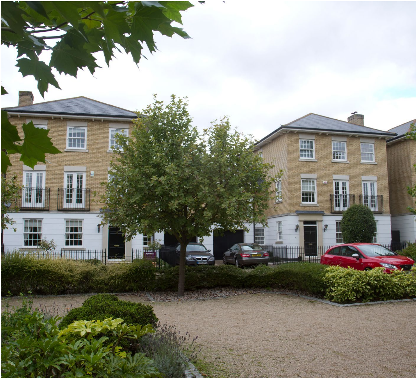
The landscaping of this housing square mirrors the town housing type, Thorley Lane, Bishops Stortford, Countryside Properties

Using the lack of local character as a justification for further nondescript or placeless development. Ignoring local traditions or character without robust justification.