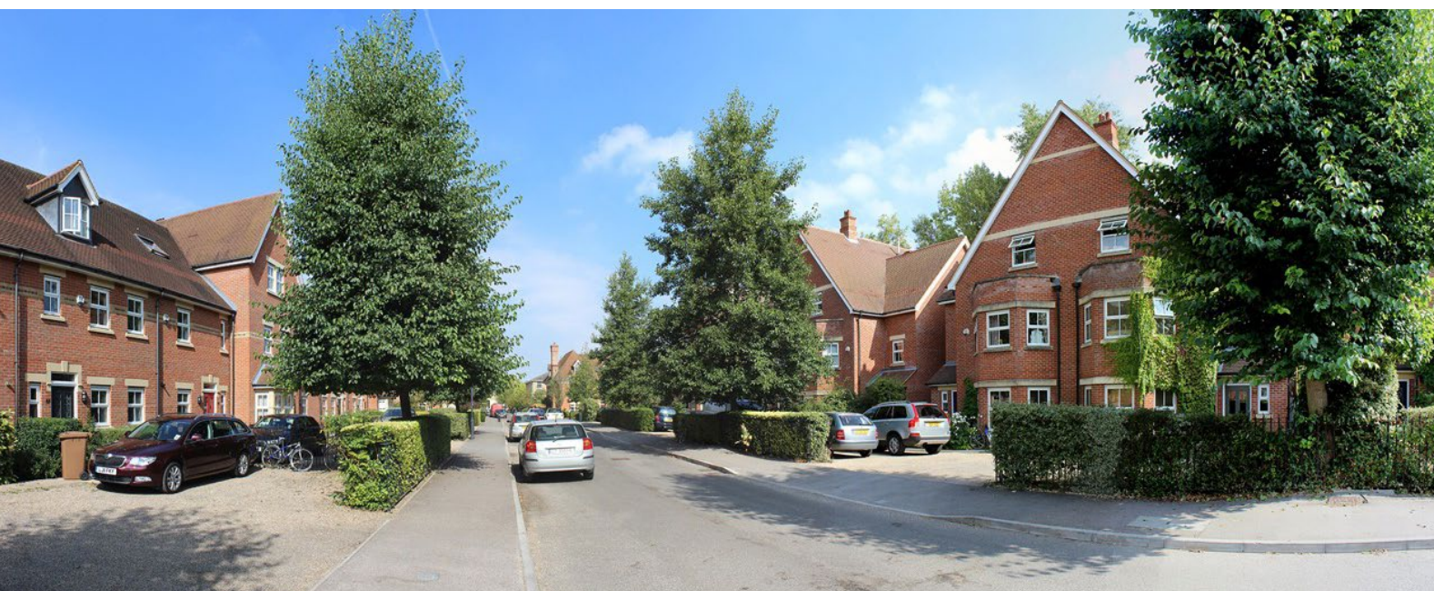
Oxford Waterside, Jericho, Berkeley Group

BfL12's questions were created to help designers and non-designers to work better together and create better places. BfL12 is primarily a discussion tool – a framework around which issues and ideas can be explored. BfL12 therefore works best if used at the start of the planning process. BfL12 is not designed to be used in isolation as an assessment tool once a planning application has been submitted. If BfL12 has not been used throughout the planning process we do not support its use as a justification for the refusal of a planning application. Likewise, if BfL12 has not been used by a developer at the inception stages of a proposed development and throughout the pre-application process, it should not be used to support an application.