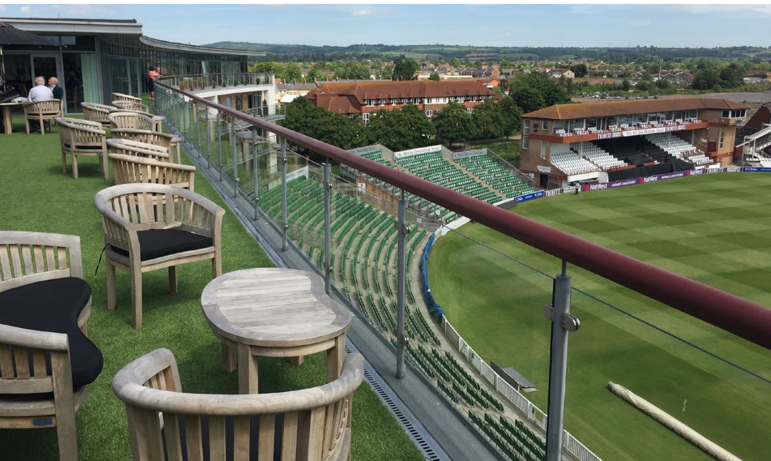
This housing for seniors incorporates a wonderful social space, Pegasus Court, Taunton, Pegasus Life