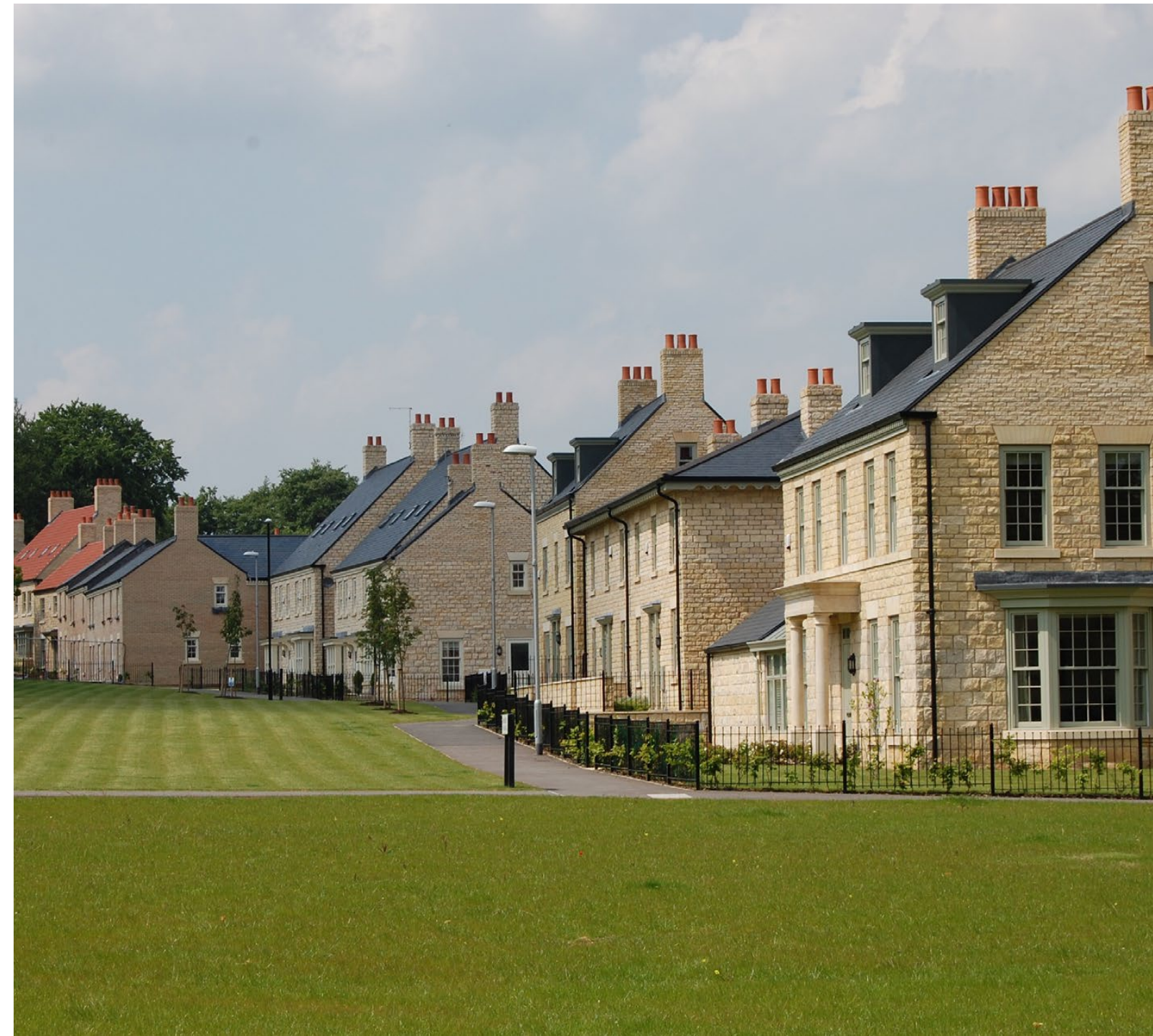
Simple, direct and overlooked footpaths encourage walking, Church Fields, Boston Spa, Taylor Wimpey

Not considering where future connections might need to be made - or could be provided - in the future.