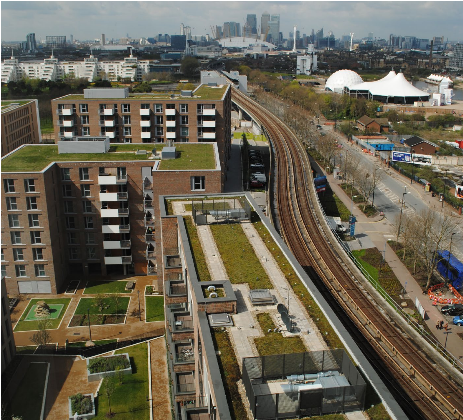
Development with easy access to Docklands Light Railway, Waterside Park, London Docklands, Barratt London

Thinking about development sites in isolation from their surroundings. For example, bus only routes (or bus plugs) can be used to connect a new development to an existing development and create a more viable bus service without creating a 'rat run' for cars.