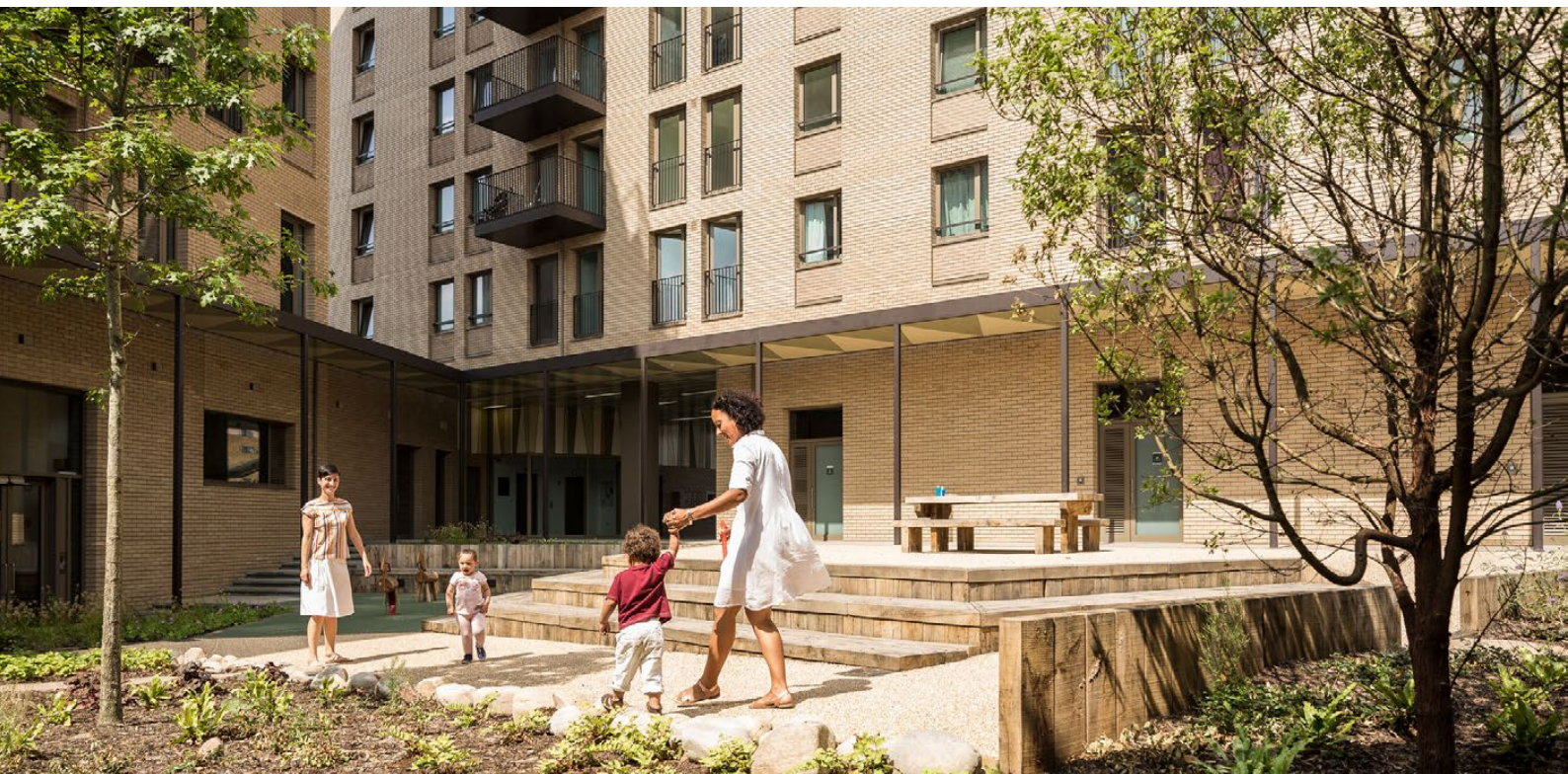
Roseberry Mansions, Kings Cross, One Housing

As outlined before, Building for Life's 12 questions are grouped in three distinct sections: