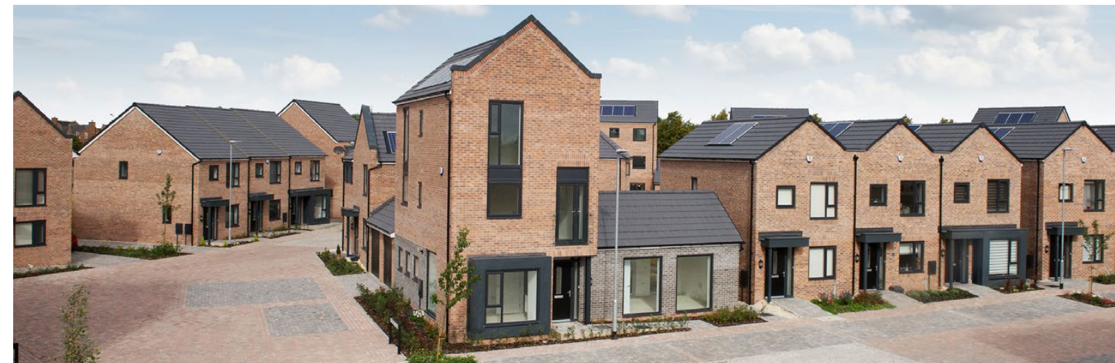
Cottam Meadow, Preston, Barratt Homes

If a scheme is considered a potential candidate for Built for Life™ accreditation there will be independent scrutiny of developments once an application has secured planning approval. Through this independent review process, home buyers can have the confidence that Built for Life™ accreditation is the sign of a good place to live.