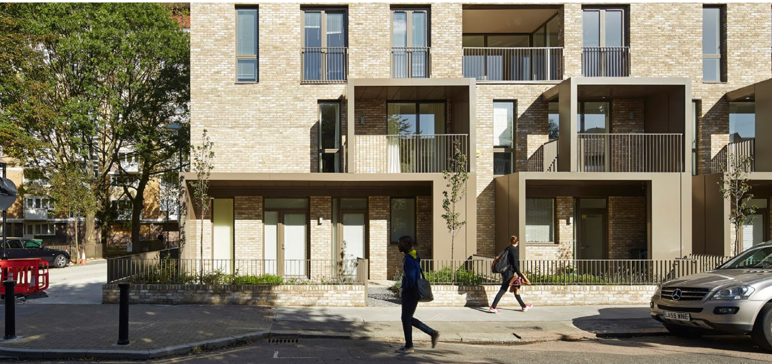
Ely Court, South Kilburn, Catalyst and London Borough of Brent

Previous versions of Building for Life have relied on Accredited Assessors to provide definitive assessments of proposed developments, however this process has now changed. BfL12 places an emphasis on design focused discussions. At the start of the planning process, all those involved including local communities and other stakeholders are encouraged to contribute towards a discussion about what a place should become and what it needs to do. Particular stakeholders might have specific concerns or interests that can be captured in one or more of BfL12's questions.