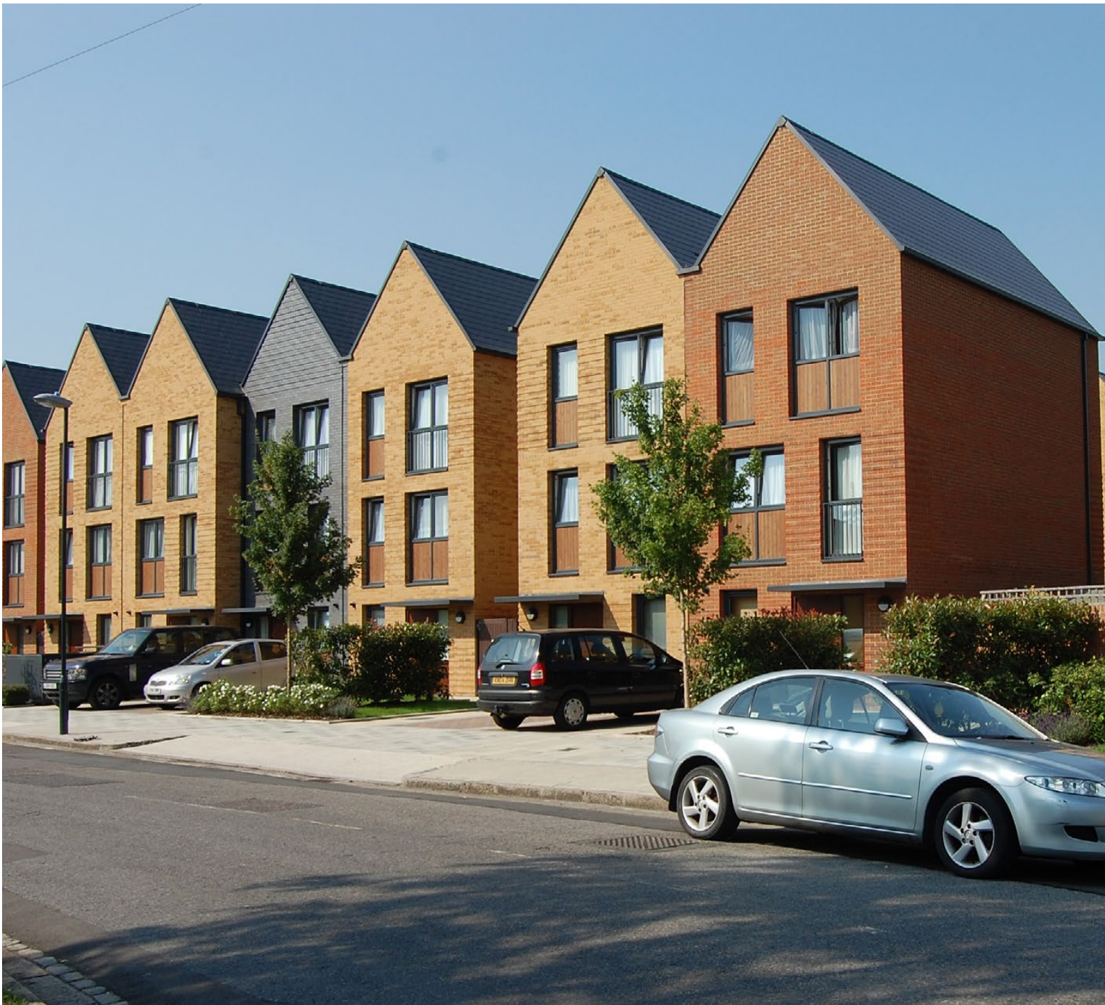
Mixed tenure houses, Kidbrooke Village, RB Greenwich, Berkeley Homes

Reducing the level of parking provision for rented/shared ownership homes.