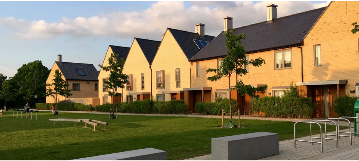
Trumpington Meadows, Cambridge, Barratt Homes

The next stage is to upload details of the development onto www.builtforlifelifehomes.org . The scheme will then be subject to a ‘light touch’ review. If the development will have a strong likelihood of achieving a quality mark, the applicant will be invited to attend a Built for Life™ panel presentation where the scheme will be considered in more depth.