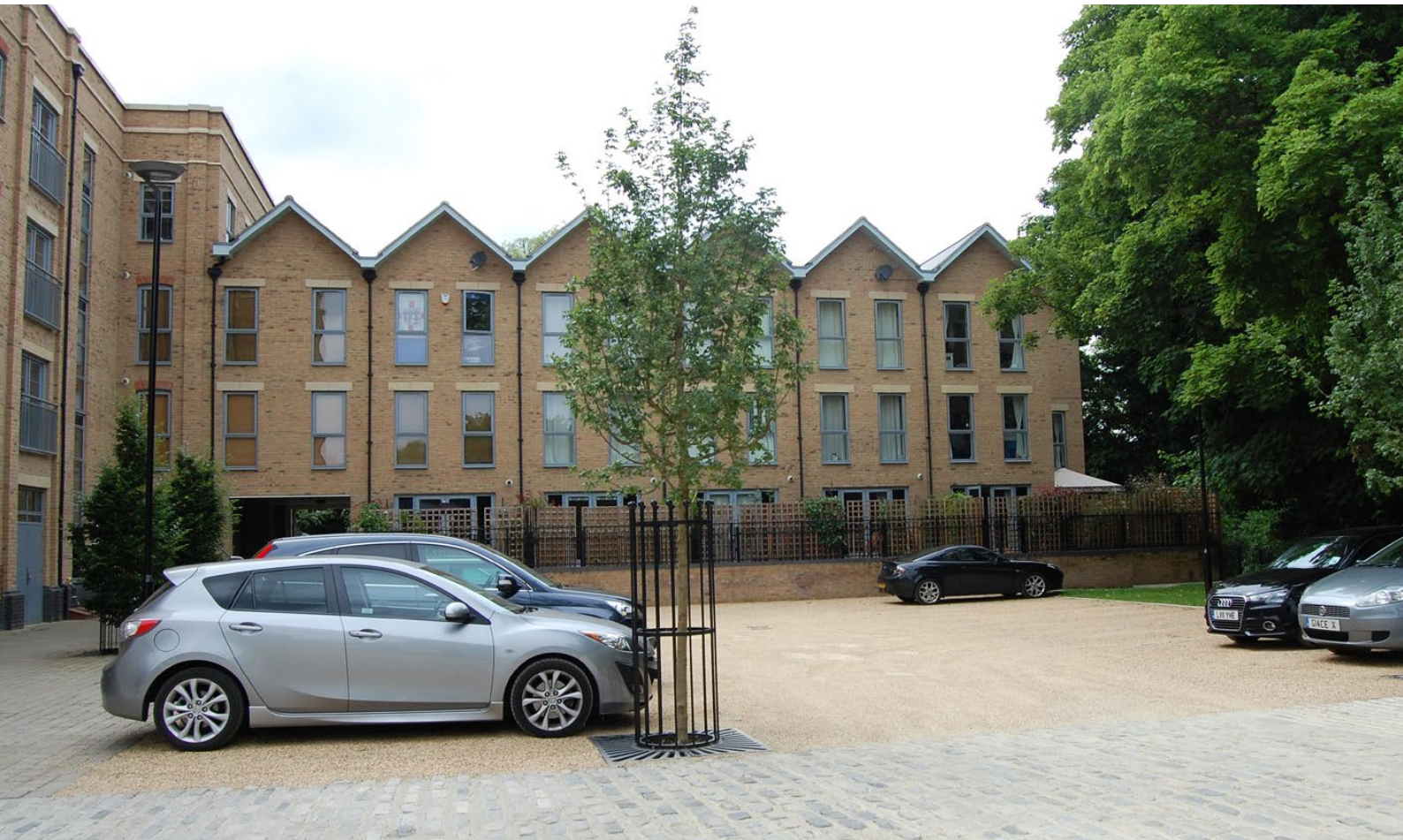
Unallocated bays in small shared courts efficiently deal with varied parking demands, The Mill, Horton Kirby, Fairview Homes