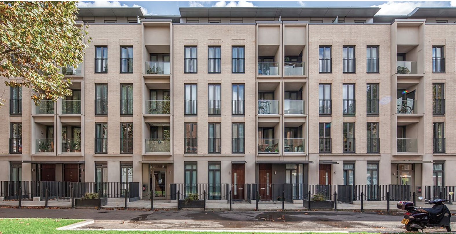
Portobello Square, RB Kensington & Chelsea, Catalyst

An increasing number of home builders are using BfL12 as a way of working to help speed up the planning process and improve the quality of the places they build. Ten years in the making, piloted on live planning applications and written to fit alongside both the National Planning Policy Framework and National Planning Practice Guidance, BfL12 has become the home building industry's preferred way of creating well-designed new homes and communities.