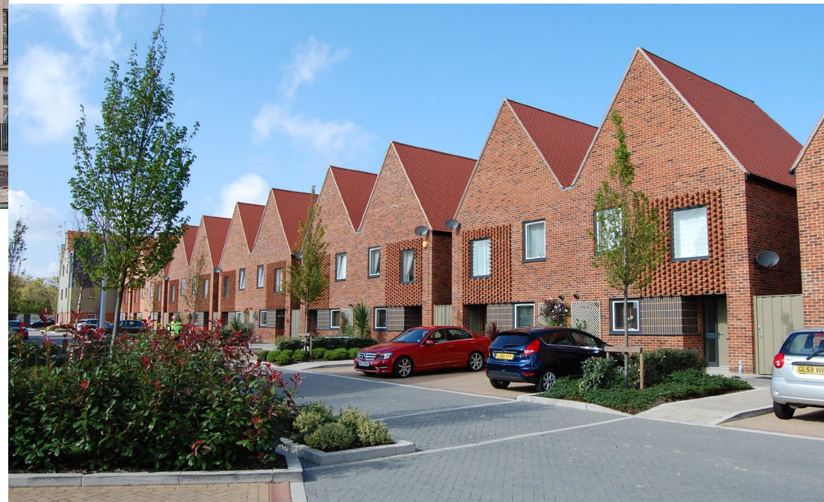
Horsted Park, Chatham, Countryside Properties

A key benefit of BfL12 is that it can help local planning authorities consider the quality of both proposed and completed developments. The jargon free language of BfL12 will help planning officers to better communicate design considerations to Elected Members. BfL12 is also useful for creating site-specific briefs, structuring Design Codes and local design policies.