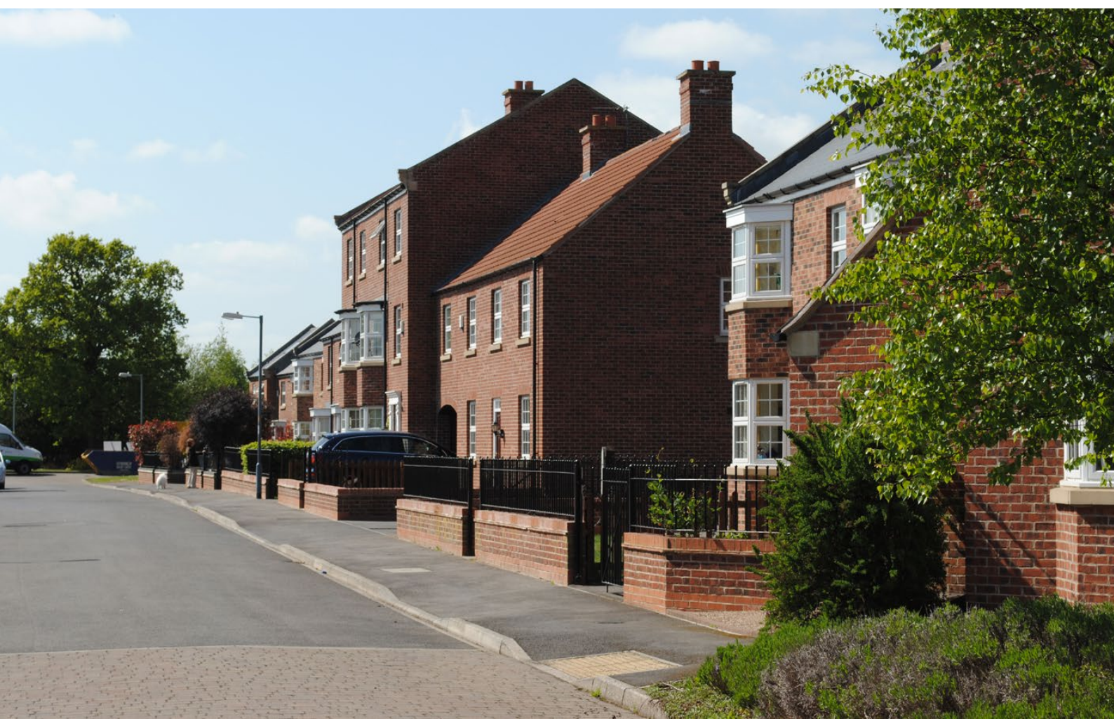
A straight building line reinforces clear distinction between public and private spaces, The Strike, Helmsley, Taylor Wimpey