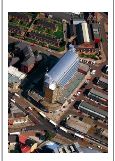
Aerial view of The Exchange

Which is a far cry from ... so many of the student HMOs you can find in any of the 'student areas' of Nottingham! And a good start to giving students a choice of good quality, well designed, suitably located, and competitively priced, non-HMO housing. It is also one way of helping to redress the imbalance in types of housing stock in the City. This lack of choice of family housing has contributed to the unsustainable migration of families out of the City. [Around 1,000 children under 15 years old are being lost each year.].