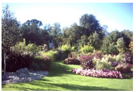
Rose's Neighbourhood & University Park Derby Road Entrance